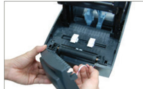
Auto-Cutter : Easy installation