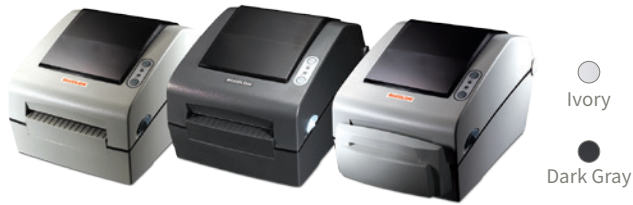
SLP-D420 (Standard Type) SLP-D420D (Peeler Type) SLP-D420C (Auto-cutter Type)

4 inch Direct Thermal Desktop Label Printer